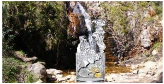
Catchment ecosystem valuation points to ways of maximising business opportunities and sustaining revenues

At the same time, catchment ecosystem valuation shows that investments in catchment management can also present lucrative new business opportunities. It is self evident that anything which improves the product (water) that SA Water is charged with delivering constitutes a business opportunity.