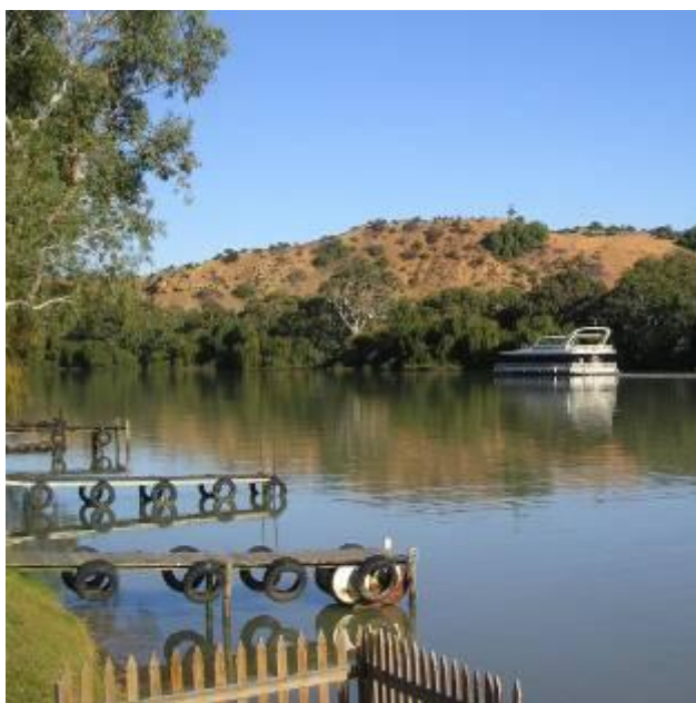
If catchment ecosystems are managed sustainably, and sufficient investments are made in their maintenance, then water of higher quality and more regular flow will be delivered. In contrast, if they are degraded or polluted, waterflow and quality will suffer.

Taken together, catchments ecosystems therefore provide important infrastructure for water quality, water supply and protection against water-related hazards. A multiple barrier approach recognises this role, because it is founded on ensuring that catchments are maintained in a state where they are able to continue to provide water services. If catchment ecosystems are managed sustainably, and sufficient investments are made in their maintenance, then water of higher quality and more regular flow will be delivered. In contrast, if they are degraded or polluted, waterflow and quality will suffer.