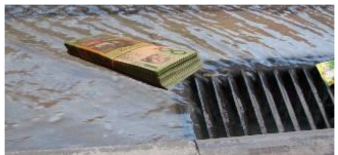
Catchment ecosystem valuation points to ways of minimising business risks and avoiding costs

Generating these wider benefits is an important way of building relationships with the catchment stakeholders whose actions bear on SA Water’s core business outcomes. It is also a way for SA Water to demonstrate its commitment to “greening” its core businesses operations, and to delivering water services in an environmentally sustainable manner.