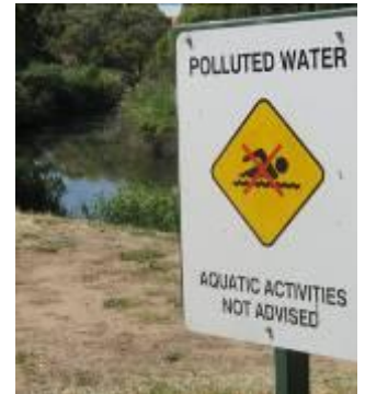
Most decisions do not account for ecosystem costs and benefits

The following section of this briefing paper looks at how the ecosystem valuation framework developed under the project was applied to the Blue Lake Catchment Ecosystem in Mount Gambier. The aim was to identify how investing in catchment ecosystem management could provide cost-effective solutions to water problems. A separate briefing paper describes the catchment ecosystem valuation methodology developed under the project, which was applied in this case study.